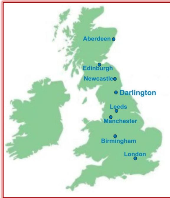
Location of Darlington