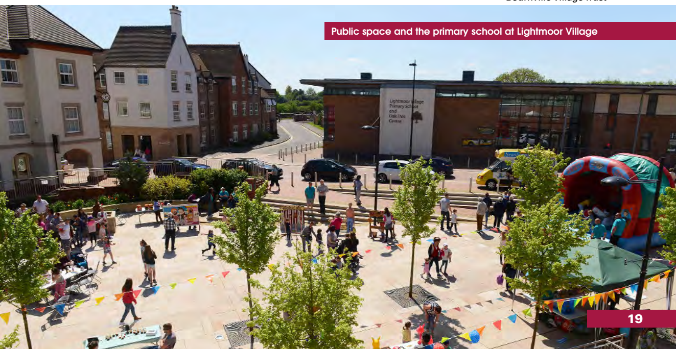
Public space and the primary school at Lightmoor Village