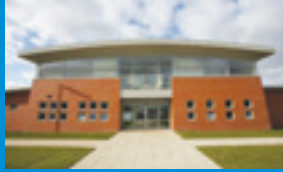
The Coleridge Centre Coleridge Gardens, Darlington, DL1 5AJ