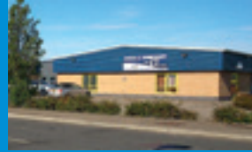
Flexspace Lingfield Way, Darlington, DL1 4QZ