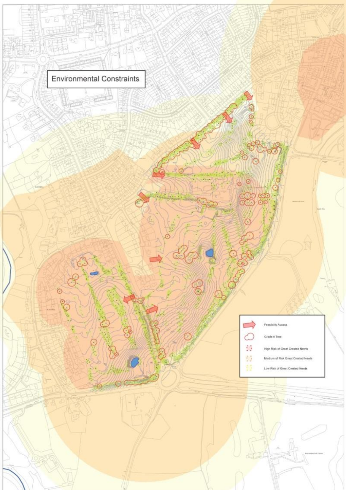
Plan showing the most important Grade A trees

group value recognised. For ease of reference the most important, Grade A, trees are identified on the diagram below.